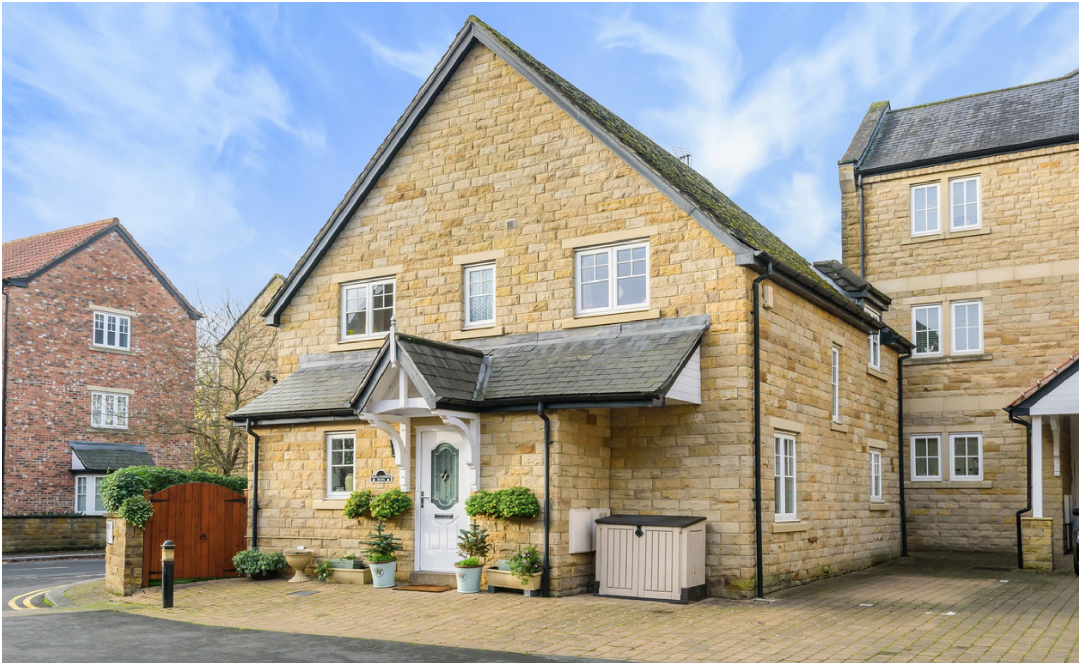
1 Mickethwaite Steps, Wetherby, LS22 5LD