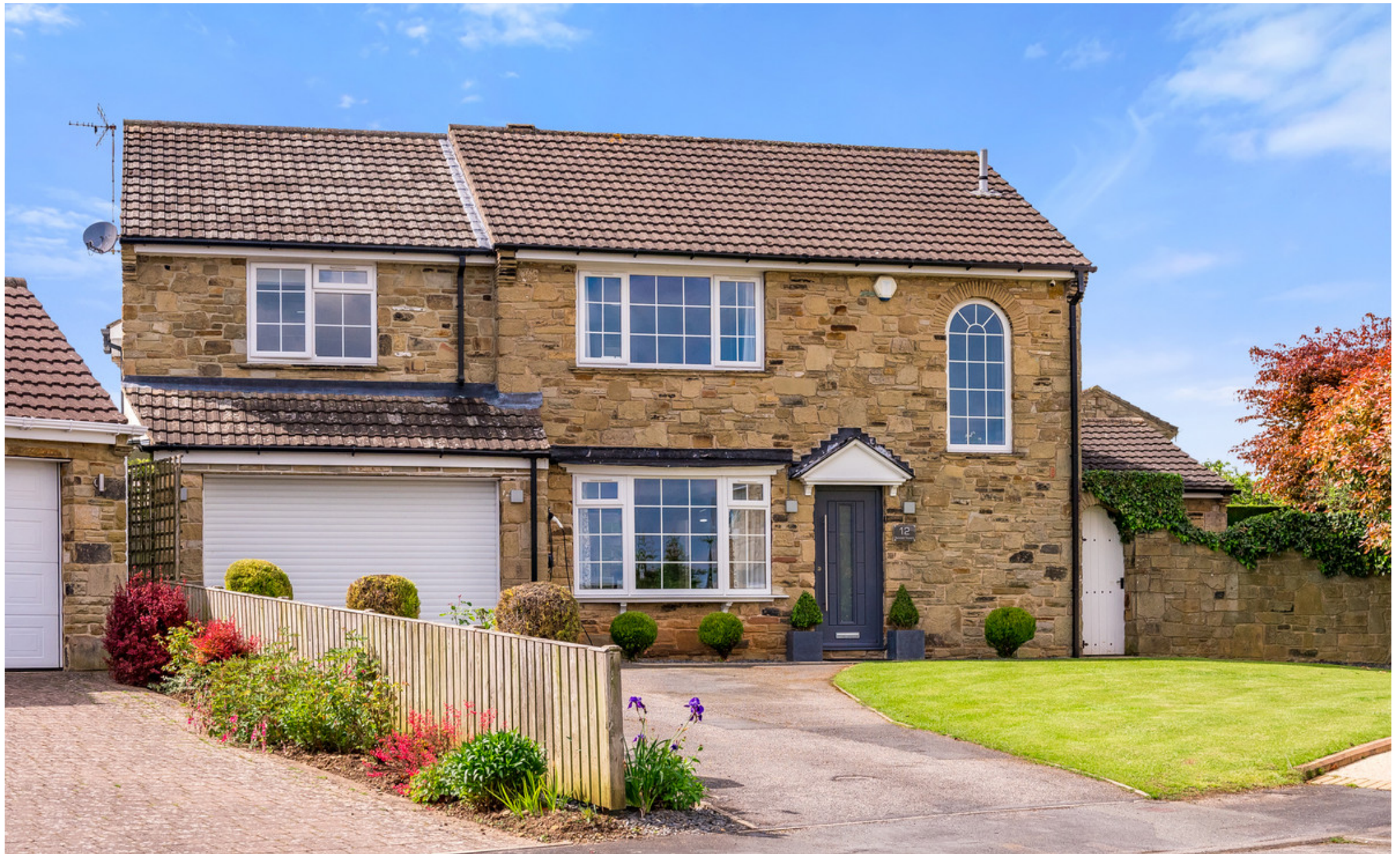
12 Ambleside Walk, Wetherby, LS22 6DP