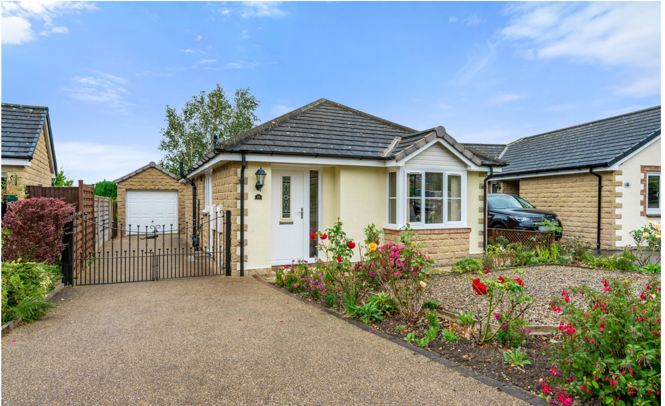
10 Barberry Close, Harrogate, HG3 2NZ