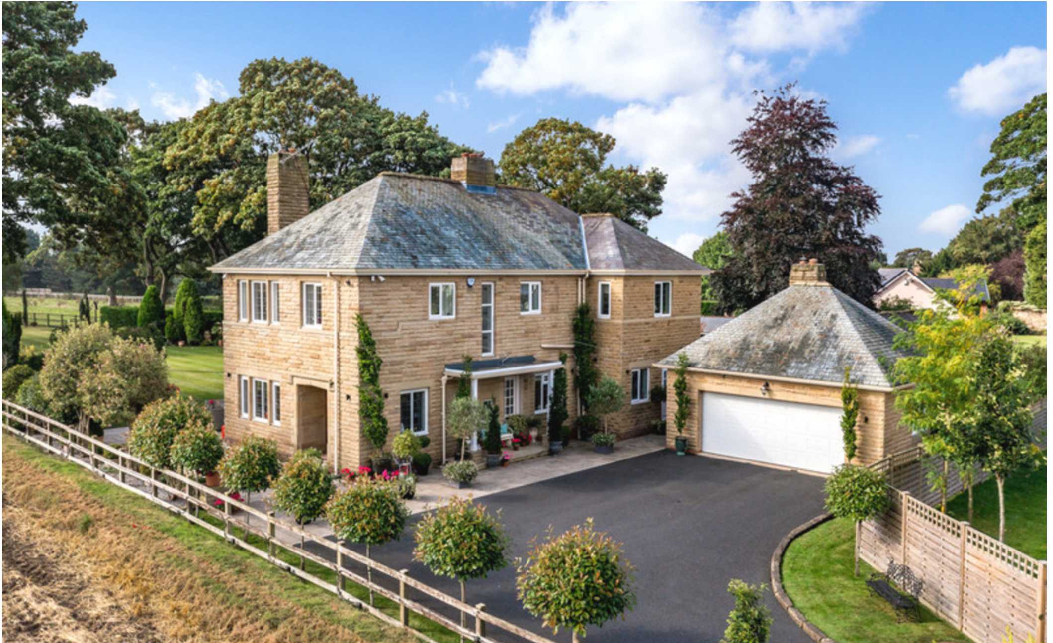
Orchard Lodge, Pontefract Road, Ackworth, WF7 7EE